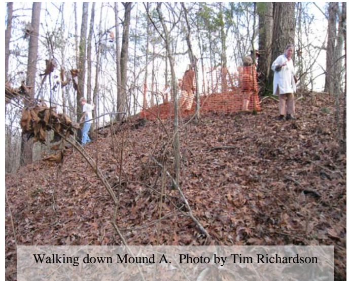
Walking down Mound A.

http://www.science-frontiers.com/sf114/sf114p01.htm